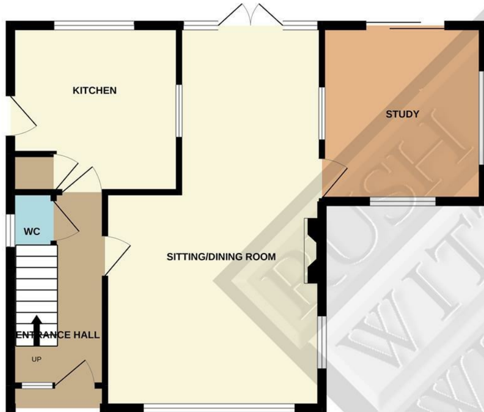
GROUND FLOOR 583 sq.ft. (54.2 sq.m.) approx.